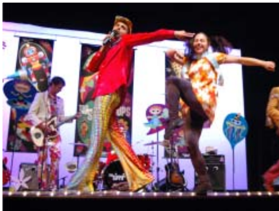
The Sippy Cups return to the Chevron Family Theatre festival on Saturday, July 24.

Artists appearing this year include The Sippy Cups, Fantasy Forum Actor's Ensemble performing The Wizard of Oz , the Pushcart Players performing Cinderella , Trout Fishing in America,