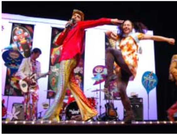
The Sippy Cups return to the Chevron Family Theatre festival on Saturday, July 24.

Artists appearing this year include The Sippy Cups, Fantasy Forum Actor's Ensemble performing The Wizard of Oz , the Pushcart Players performing Cinderella , Trout Fishing in America,